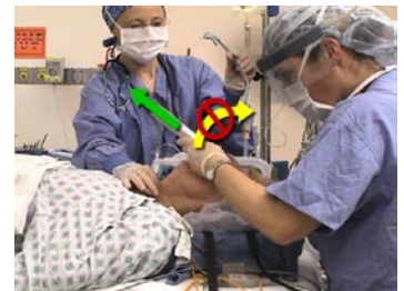
Figure 4. Proper orientation of the lifting action