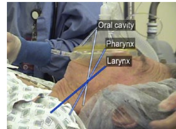
Figure 2. The "sniffing" position

In many cases, a neuromuscular-blocking agent and a potent sedative are needed to facilitate intubation. These agents will improve your visualization of the vocal cords and prevent the patient from vomiting and aspirating gastric contents. 3 If you plan