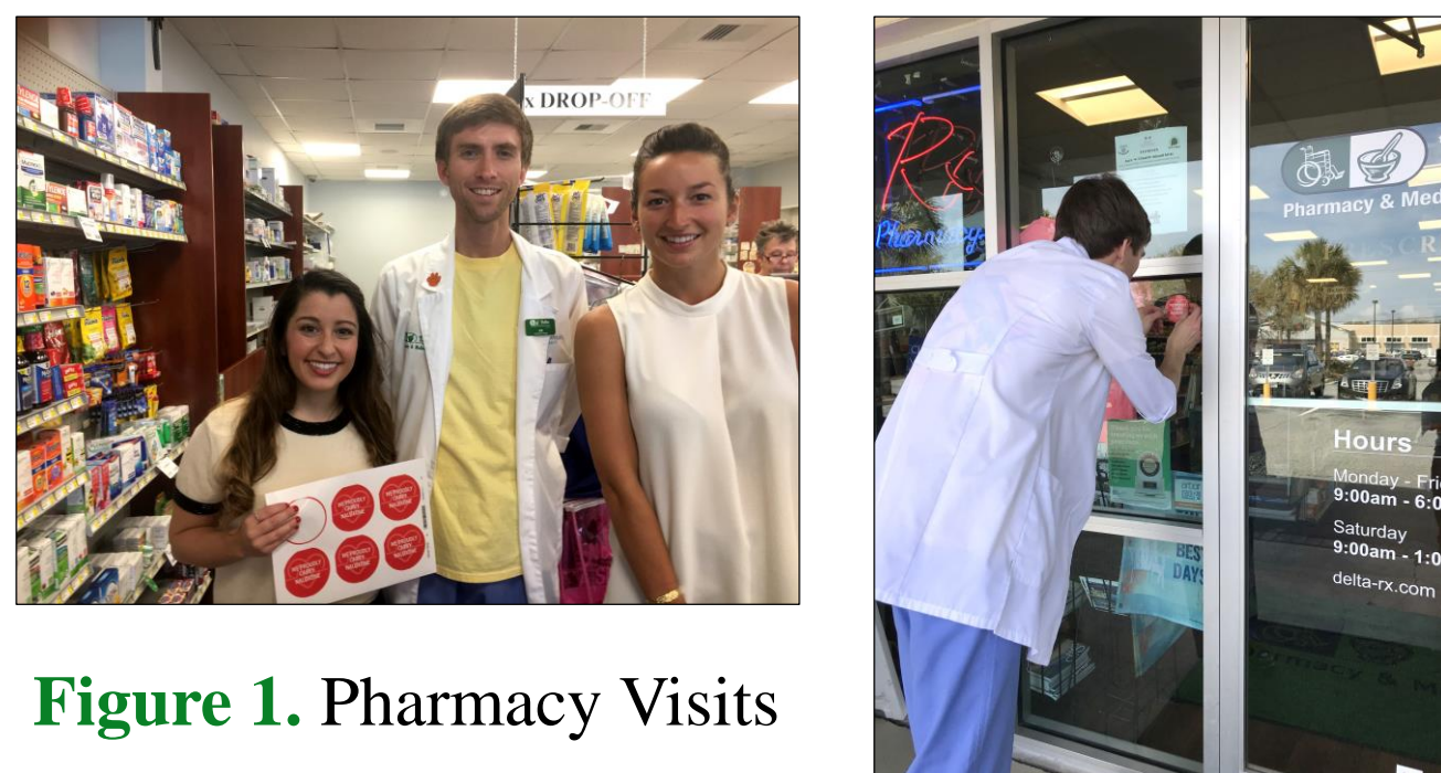
Figure 1. Pharmacy Visits

We visited several national and local pharmacies in the greater Charleston area with mixed results. About half of the pharmacies were aware of the policy and had implemented it. The pharmacists who were not aware of the policy change were amenable to implementing it as long as they received approval from their parent company. Some pharmacists who were aware of the new policy offer Naloxone to patients with high dose opioid prescriptions. Other pharmacists still require that their patients have a written prescription for Naloxone from their physician.