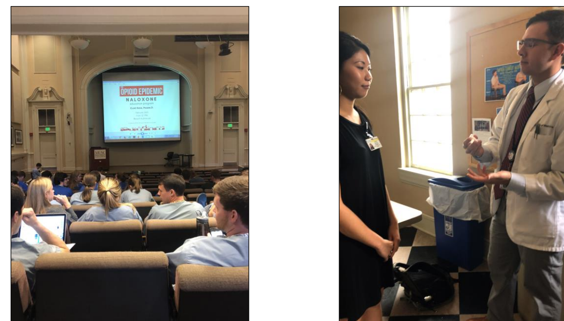
Figure 2. Naloxone Education Seminar