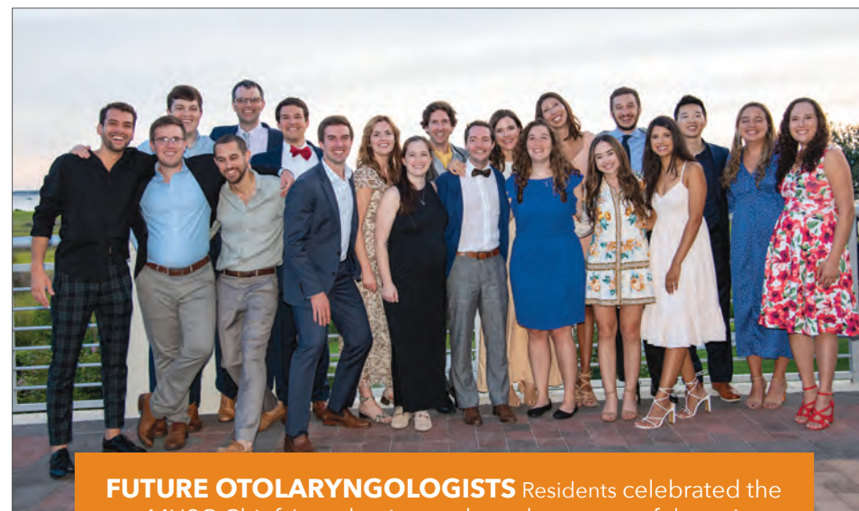
FUTURE OTOLARYNGOLOGISTS Residents celebrated the MUSC Chiefs' graduation and another successful year!